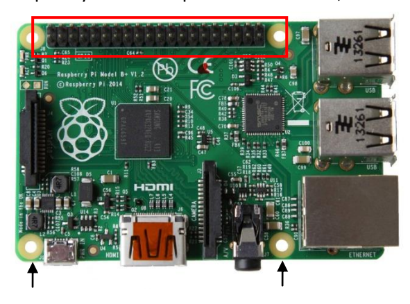
Diagram 2: Raspberry Pi with 40-pin extended GPIO connector outlined in red

This Cirrus Logic soundcard has been designed to plug in to Raspberry Pi simply and easily. It is compatible with Raspberry Pi with 40-pin extended GPIO, such as models A+ and B+.